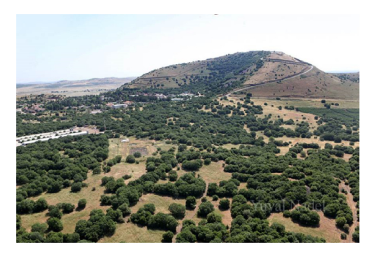
Fig. 2. Merom Golan on the Golan Heights.

The function of settlements in the West Bank has been very different. Unlike Merom Golan, they were almost always built on hilltops overlooking Palestinian villages (note that the topography of the two regions is also different) so that they could serve as mechanisms of civilian surveillance (B'Tselem, 2002). In and of