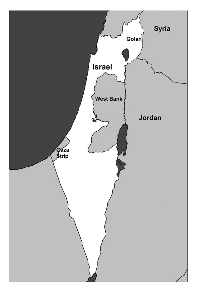
Fig. 1. Map of Israel similar to the one that appeared behind Jon Stewart. The West Bank is depicted as a separate entity, while the Golan Heights, which were occupied by Israel during the same war, are presented as an integral part of Israel.

a series of contradictions stemming from the settler's inability to totally prohibit the indigenous population's access to the territory – the primary objective of settler colonialism (Rose, 1991).<sup>1</sup>